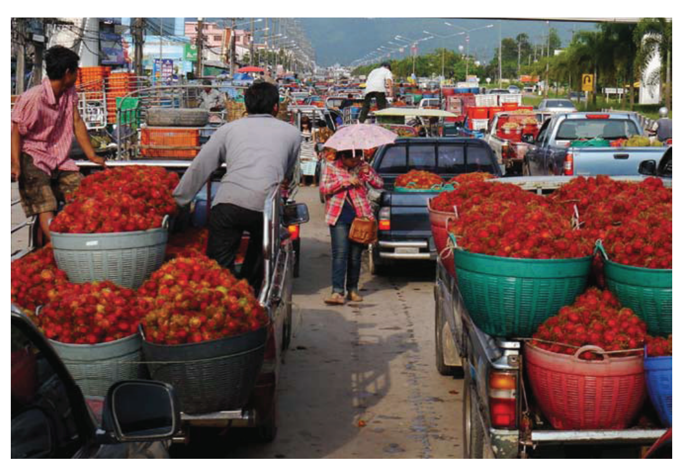
Fruit trading at Nong Khla, Chanthaburi

The intensified export of tropical fruits has left its mark on the production, harvesting and marketing of fruits. Some marks are intentional. The 'Fruit Strategy' of the Thai Ministry of Agriculture and Cooperatives emphasizes raising the quality of the fruits and encouraging farmers to produce according to internationally