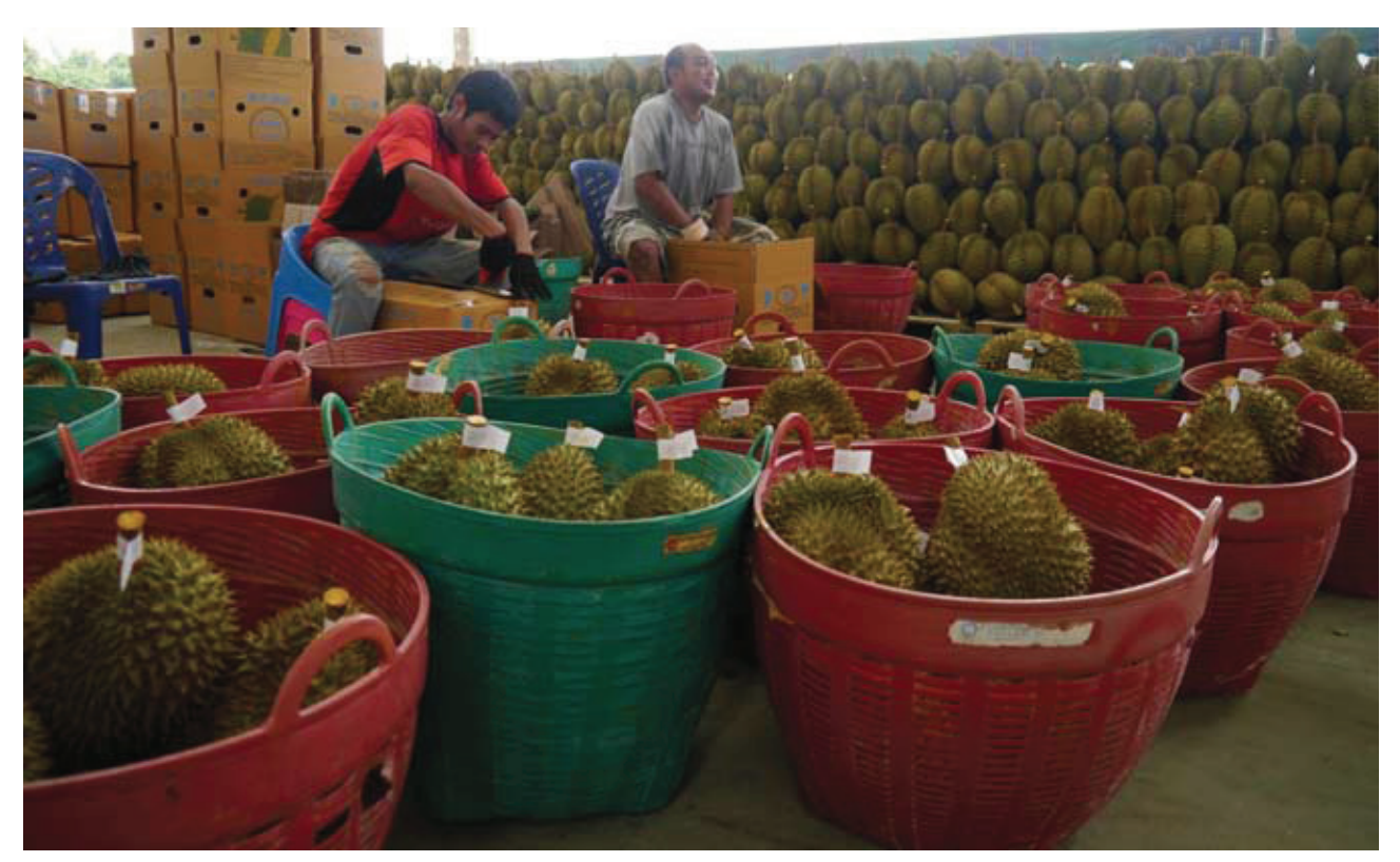
Packing durian for export in Noen Sung, Chanthaburi

Export is booming. Every year, hundreds of new fruit purchasing depots spring up in the region, often run by Chinese traders. During the fruit season, April to June, these places are bustling with activity. An endless parade of fully loaded pick-ups provides a continuous supply. Work is done with impressive efficiency; quality is checked on the spot, fruits are instantly packed in boxes and loaded onto large container trucks, while the drivers take a nap in their hammock before they head to China. The road network through Laos has seen major improvements to