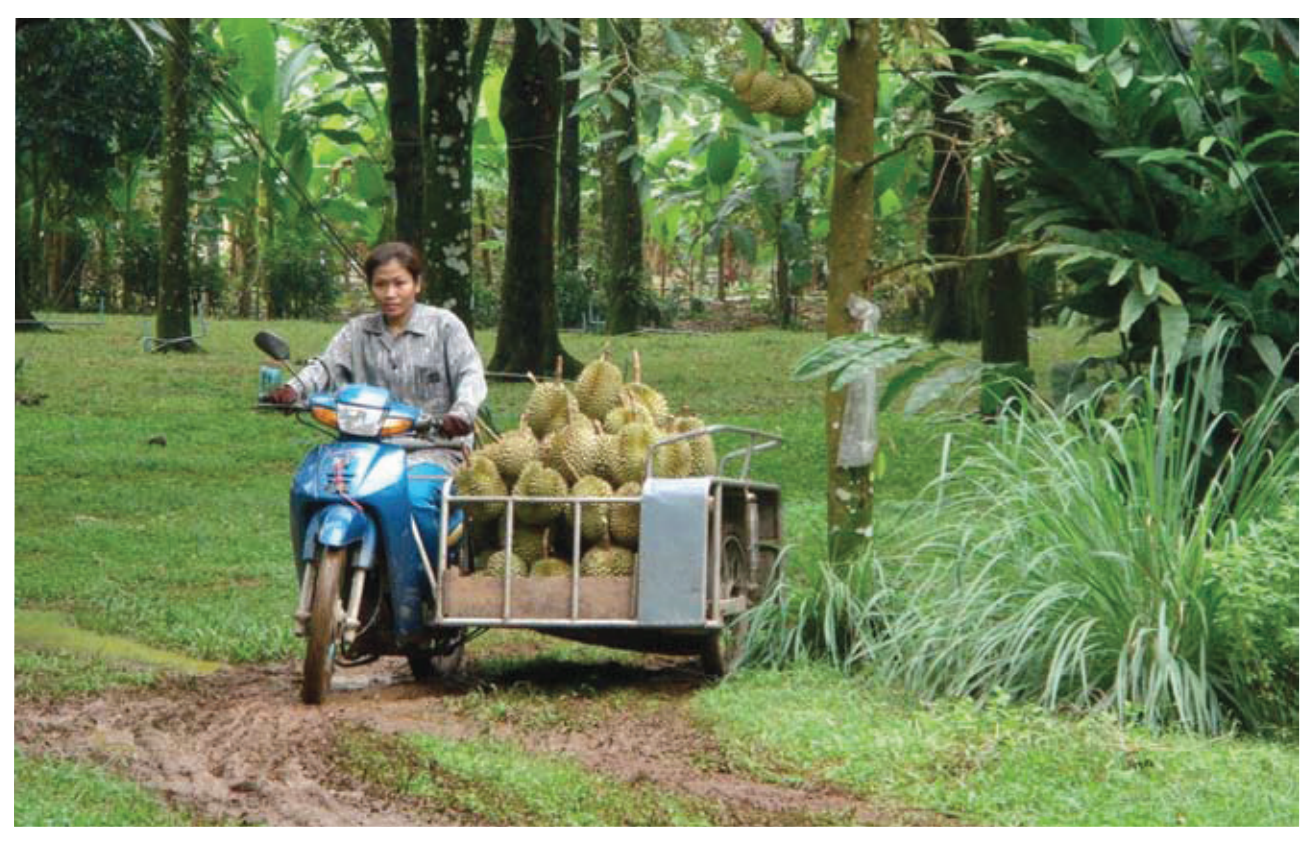
Harvesting durian in an orchard in Tha Mai, Chanthaburi

A ny social gathering in Thailand is showered with fruit. Not with endless cups of coffee, like in my homeland Holland, but with baskets of mangosteen, rambutan, longan, lamut or lychee. And of course durian – if only to try me out. Europeans reputedly detest the strong-smelling 'King of Fruits'. I happen to like it, and earn both admiration and disappointment.