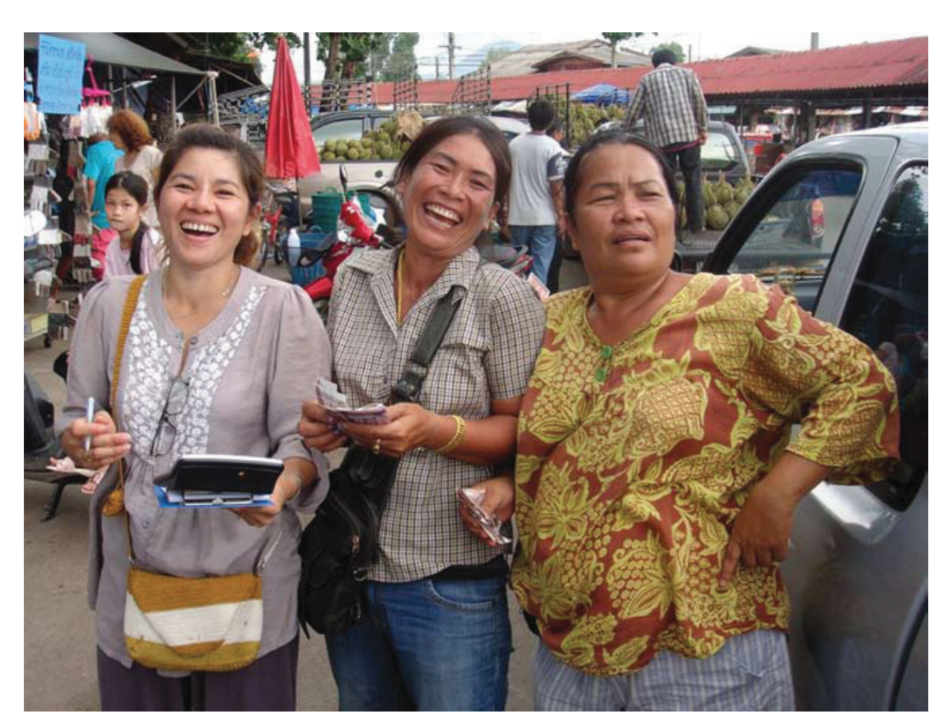
Fruit traders at the market of Noen Sung, Chanthaburi

In the family of my Thai friends, it is the materfamilias, a lady of almost eighty years old, who owns all the land on which her highly educated children grow their crops. She is the one who decides which new plots of land are bought and which son or son-in-law is allowed to try his skills on it. And of course she is the one who assembles and distributes the earnings among her offspring.