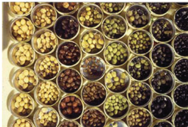
Bean seeds stored in sealed cans in a seed bank.

In up-to-date seed-storage laboratories all over the world, computerised systems have been developed for keeping track of the vast number of seed collections in storage, distribution and rejuvenation.