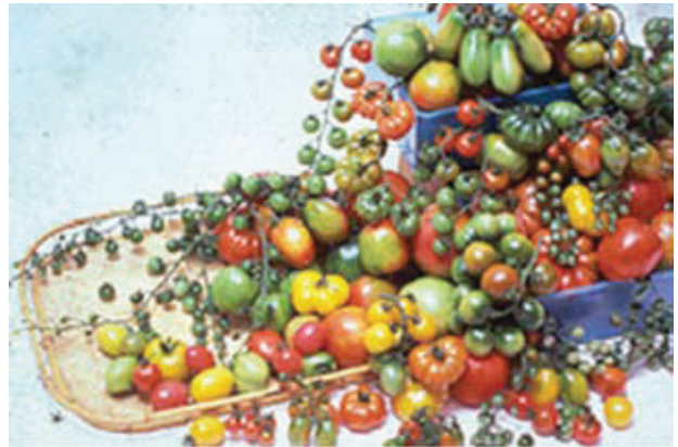
Diversity of tomato varieties

The production of a new 'miracle' plant or seed is the result of the crossing of genetic materials present in the gene pool followed by selection of desirable types. The continuing disappearance of plant varieties reduces the number of different genes available for breeding. Today, we depend only on four cereals — wheat, rice, maize and sorghum to supply the staples for the world's population. This dependence on a narrow selection is dangerous, with serious repercussions should any one of these fail for any reason. Our ability to cope with a disaster depends on the genetic resources of plants that are available to plant breeders for breeding. In 1970, Brazil's high-yield coffee crop, the country's biggest export item, was suddenly struck by an epidemic of leaf rust that devastated the crop plants. Many other examples can be quoted. The narrowing of the genetic base has the result of limiting the options available to breeders for improving today's plants or creating those of tomorrow. We have no way to predict what our genetic needs in the future will be. It would be best to save all of the world's plant species, just in case.